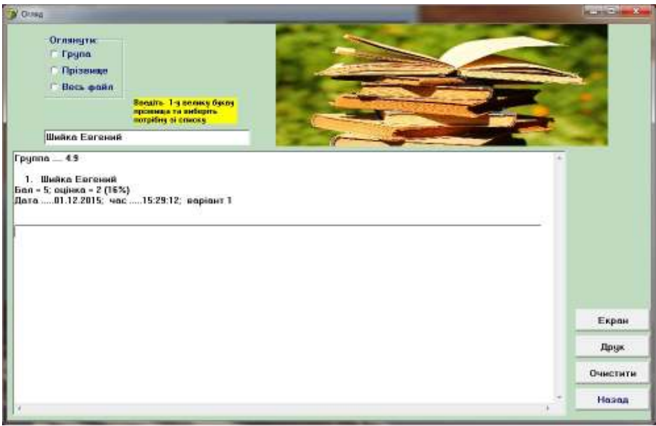
Figure 2. Test results window

The control component is displayed as a computer test presented by three equivalent 30-item tasks. As the test is completed, the program provides information about the number of correct answers and grades (Figure 2).