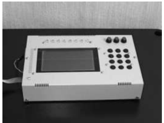
Fig.1 Microcontroller-based stand.

For learning and designing the microcontroller systems we have a special laboratory stand ML-1 (Fig. 1). This stand bases on RISC architecture of AVR microcontroller ATmega-128 from ATMEL and consists of ISP and JTAG-programmer ports, extended RAM and flash-ROM, 4\times3 matrix keyboard, functional keys, module of 8-bit light-emitting indication, 240\times128 LCD-display, serial interface RS-232C, build-in temperature sensor and digital input/output connectors. This stand allows designing a simple microprocessor control systems.