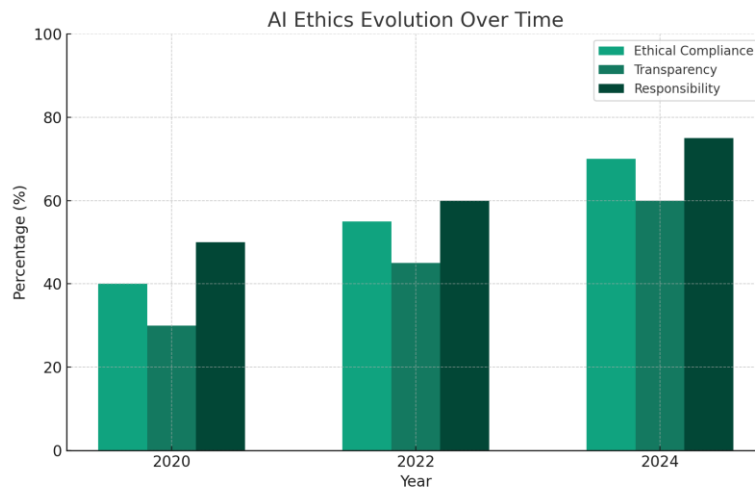
Figure 1: AI ethics evolution over time

In addition to the aspects previously discussed, it is crucial to delve deeper into the impact of Artificial Intelligence (AI) on human relationships and the corresponding ethical considerations. Modern AI profoundly affects not only our industrial and economic activities but also the way we interact with one another, raising new ethical challenges about privacy, bias, and manipulation.