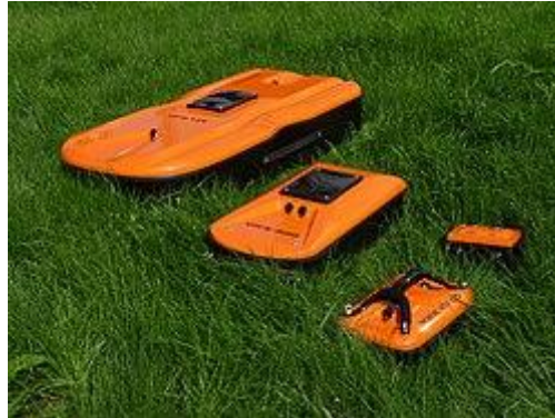
Figure 1 – Ground Penetrating Radar (GPR)

high efficiency in finding metal casings (for example, TM-62M type mines), the method has a significant drawback—the "clutter effect" or high sensitivity to metal debris. Furthermore, it demonstrates low efficiency against modern plastic mines (PMN-2, PFM-1), where the metal content is limited only to a striker or detonator weighing a few grams. To overcome these limitations, radar methods are utilized with the help of Ground Penetrating Radars (GPR) [2] (Fig. 1).