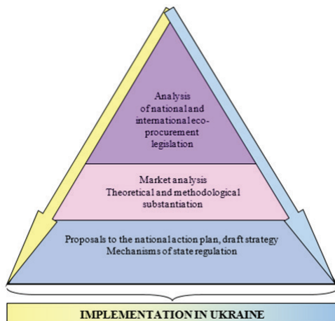
Fig. 1. Algorithmic sequence of eco-procurement implementation

It is well known that the condition and quality of roads have a direct impact on the pace of economic development. The annual statistics of the Swiss organization The World Economic Forum shows that in Ukraine the improvement of the quality of pavement is not noticeable. In the current road quality rating, which is included in the Global Competitiveness Index (2017-2018), our country is in seventh position at the end and is in 130th place out of 137. Last year (2017) we were in 137th place out of 144 positions. According to the rating, roads in Mauritania, Yemen, Guinea, Madagascar, Haiti and the Congo are worse than in Ukraine. However, this rating was calculated according to 2016 data, so the calculation did not take into account large-scale repairs carried out throughout Ukraine. Last year, a record number of 2177 km of roads was repaired in Ukraine over the past 14 years. This year, according to Ukravtodor website, it is planned to repair up to 4000 km along with roads of local importance [2].