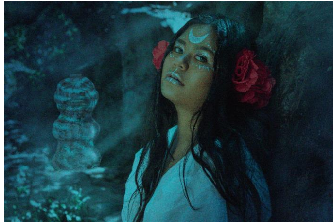
Figure 1 – Search

Now let's see, photography II, addressing the narrative structure, this would be act two, that is, the development of the photographic series. The premise of the photograph is the following "The encounter with the possibility of the realization of your desire is not a coincidence" we will title this photography as A WINGED BEING . In this photography the co-protagonist character is the hummingbird, this bird has a Aztec legend " Huitzilin Huitzil is the Nahuatl name of the hummingbird, and it was a sacred animal for the ancient Aztecs, who considered it a twin, in another case the son of Huitzilopochtli, or their own god of war..." (Ramos, Romero, Cabrales & Cruz, 2009. In Regarding color, the yellow color is predominant "Yellow radiates, smiles, it is the main color of kindness" (Heller, 2004, p. 153) this connects with the reverence that the main character makes towards the hummingbird and the color blue, as distant and infinite, since perspective produces an illusion of space. The photography was revealed in Raw Camera and intervened in Photoshop 2022 as we can see in fig. 2.