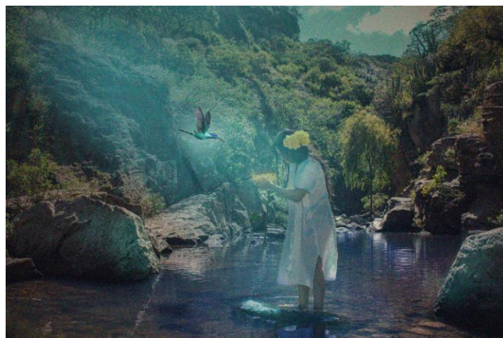
Figure 2 – A winged being

Now let's see, photography II, addressing the narrative structure, this would be act two, that is, the development of the photographic series. The premise of the photograph is the following "The encounter with the possibility of the realization of your desire is not a coincidence" we will title this photography as A WINGED BEING . In this photography the co-protagonist character is the hummingbird, this bird has a Aztec legend " Huitzilin Huitzil is the Nahuatl name of the hummingbird, and it was a sacred animal for the ancient Aztecs, who considered it a twin, in another case the son of Huitzilopochtli, or their own god of war..." (Ramos, Romero, Cabrales & Cruz, 2009. In Regarding color, the yellow color is predominant "Yellow radiates, smiles, it is the main color of kindness" (Heller, 2004, p. 153) this connects with the reverence that the main character makes towards the hummingbird and the color blue, as distant and infinite, since perspective produces an illusion of space. The photography was revealed in Raw Camera and intervened in Photoshop 2022 as we can see in fig. 2.