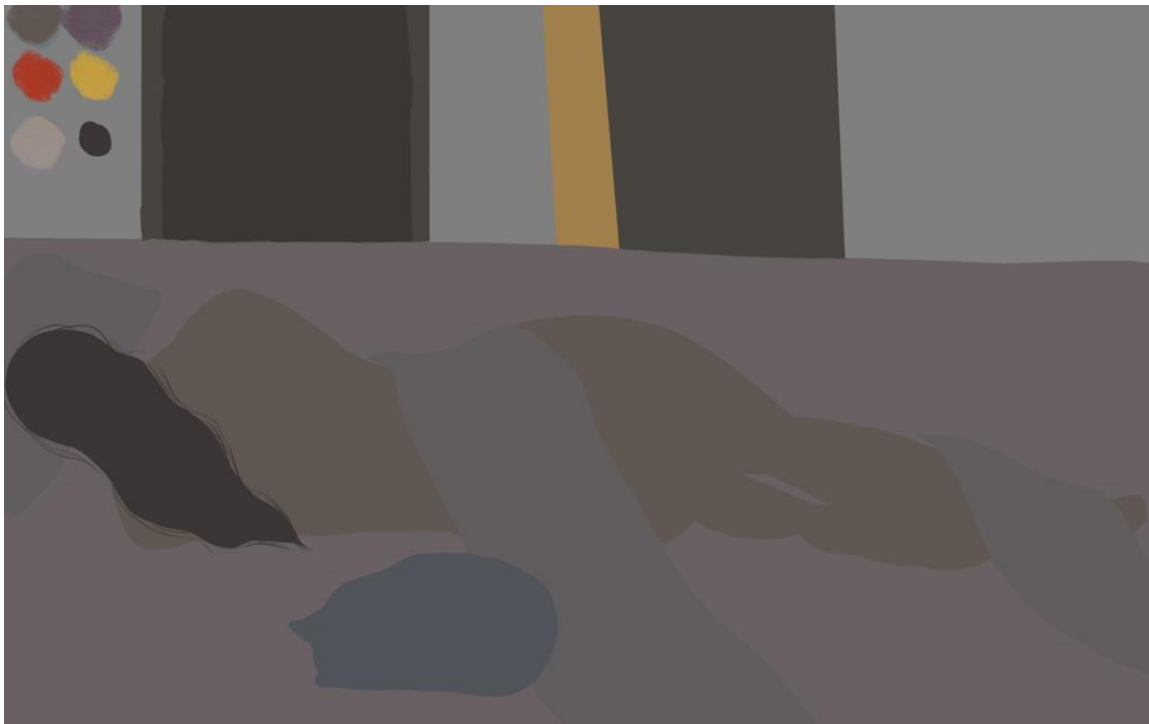
Figure 3 – Base, The Cat .