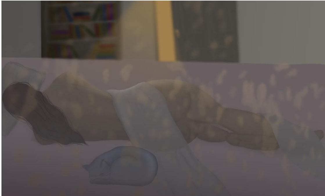
Figure 4 – Base, The Cat (colors)