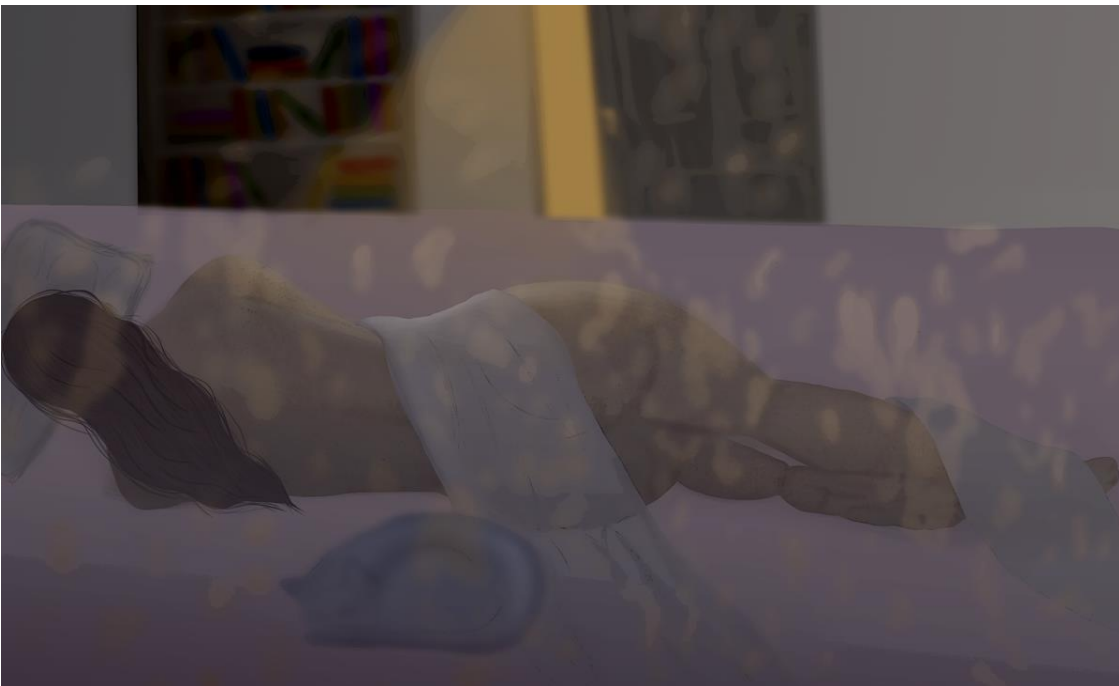
Figure 5 – The cat . Final.

In conclusion, the textual journeys that Jesús Camarero proposes allow the literary discourse to be transferred to the visual arts. This translation mechanism. one discourse to another is perceived as a textual journey. This journey allows access to a visual interpretation of a text and incorporates our personal catalogs and our previous readings.