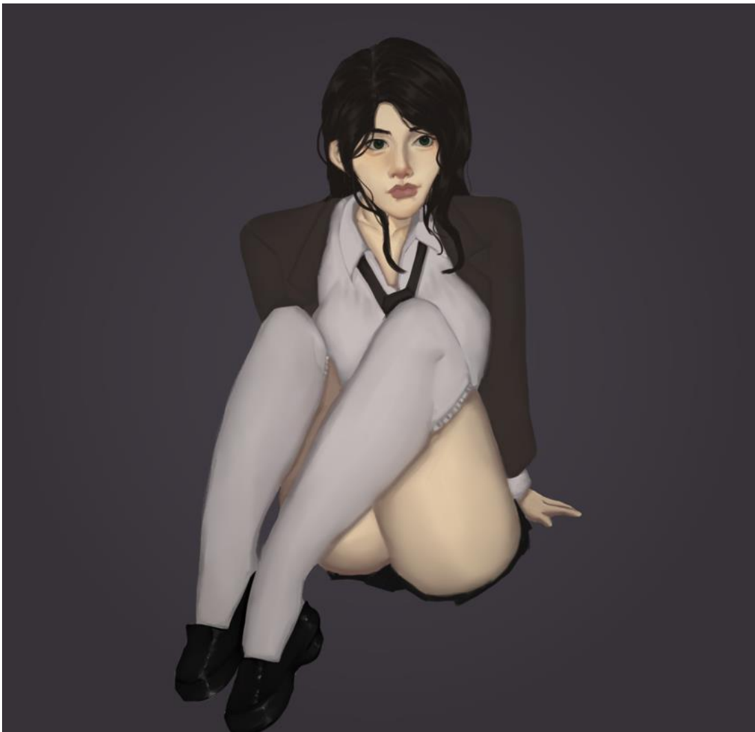
Figure 1 – Woman and desire.

Juan García Ponce alludes at various moments in his work to the importance that Nabokov has in his literature. This confirms the presence of the Russian writer in the Mexican writing. In this way, the intertextual relationship is verified: