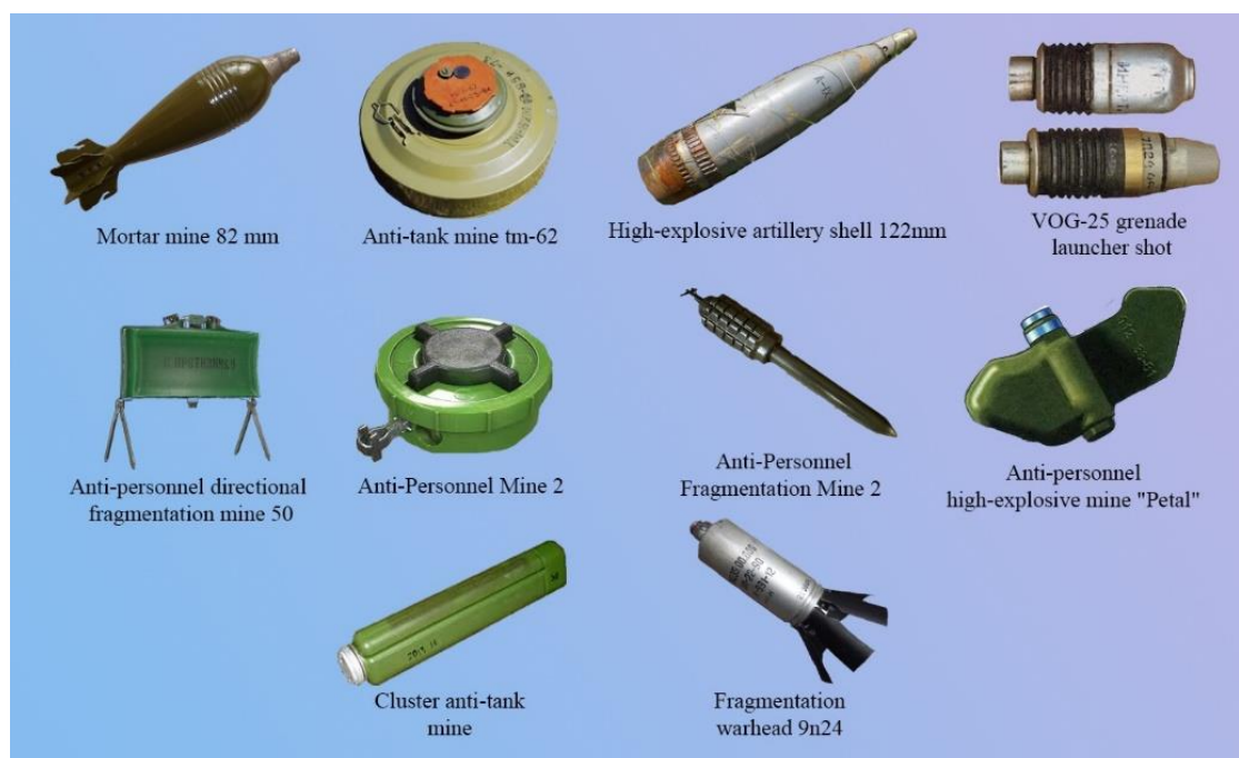
Fig.1. Types of mines and shells and their brief description

Unexploded landmines can include projectiles that have been fired but have not detonated or ruptured for any reason. They are most often found up to 1 m deep near the ground or on the surface of the ground. They are dangerous because they can detonate and explode at any moment.