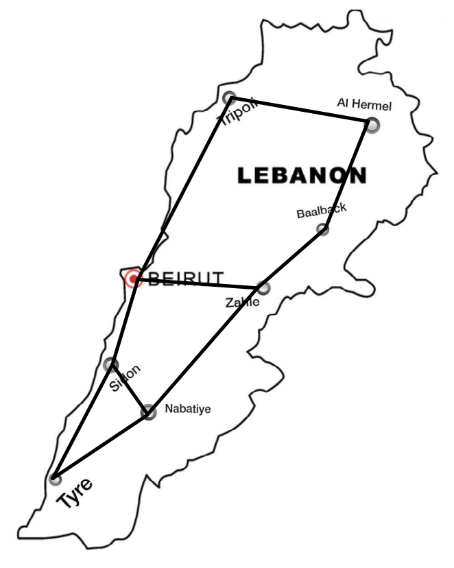
Fig. 1. Example SDN data plane topology for Lebanon

Then the structure of the network (SDN data plane) and the probabilities of compromise of its communication links be presented in Fig. 2. It should be noted that the numbers of nodes correspond to the numbers of cities shown above in Fig. 1.