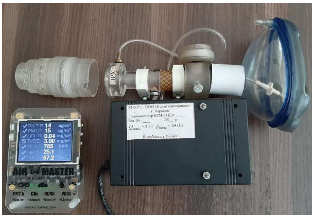
Fig. 3. Appearance of measuring blocks of hardware-software complex

The results of the nasal breathing test with measured respiratory air readings are transmitted via USB to the data analysis module for further processing and evaluation. Appearance of measuring blocks of hardware-software complex is shown in fig. 3. The unit for monitoring air parameters is implemented on the basis of the AIRMASTER air quality monitor. The unit for studying the function of nasal breathing is implemented on the basis of a computer rhinomanometer — a device for testing nasal breathing on the basis of a module for measuring flow-rate characteristics and an olfactometric nozzle produced by KNURE [16].