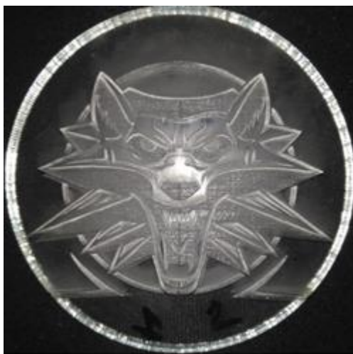
Fig. 3. Acrylic glass engraving performed according to the specified modes

In order to find out the exact values of the parameters, as well as to build graphs based on them, you need to add the "Probe" function, which will read this data and add it to the tables. As can be seen from the temperature values, it is higher than the ablation temperature of organic glass. This means that in real-world conditions with these settings, the laser will perform glass engraving (Fig. 3).