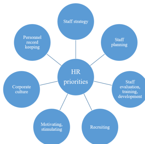
Fig. 1. The main trends of HR operation (author's development based on) [2]

HR is a structural subdivision of an enterprise business line which systematically executes the function of personnel management of the enterprise. HR activities are diverse and multifunctional and are involved in all areas of the activities of the enterprise. Constant exaggerated development of the high technology field specifies the permanent adaptation of HR service. The main trends of HR operation at a high-tech enterprise are given in fig. 1: