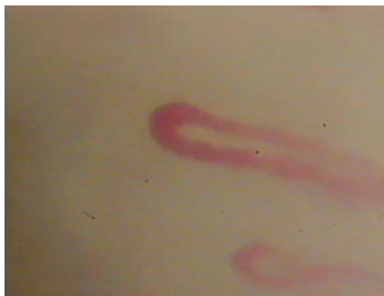
Figure. Normal capillary image

In the process, we gradually came to the following classification with goal of a more complete clinical interpretation of changes capillaroscopic picture. Some of them: the shape of the capillary, the length of the capillary, the characteristic of the capillary in caliber, the specific gravity of the capillaries, the level of blood supply, the speed of capillary blood flow, the background of the capillary field, etc. All these indicators can help recreate the picture of the patient's health status and identify pathological disorders in his body.